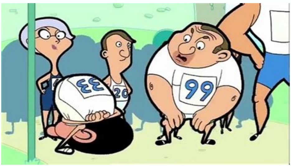
Funny cartoon youtube.